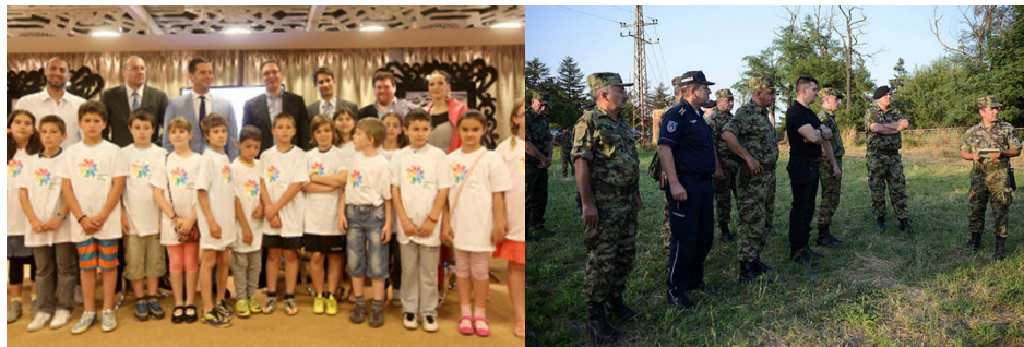
Figure 2d – Support of the Government in all other situations Рус. 2г – Государственная поддержка в других ситуациях Slika 2d – Podrška države u svim drugim situacijama