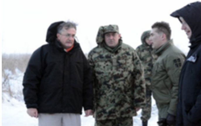
Figure 2b – Government support in emergency situations (snow drifts in Banat and Backa)

Without the impact and contribution of leadership of the country, personal example, the development of the system of defense and the support to scientific research in this field, the efforts of other members of society may be negligible, and the results of their work can be reduced and brought down to a local character from case to case, if the state does not encourage leaders at all levels by giving its support to scientific research, by raising environmental awareness and responsibility, and by reacting in emergency situations – disasters. The examples are as follows: marking the 60th anniversary of the Military Technical Courier, snow drifts in Banat and Backa, floods in Obrenovac, etc., where the state showed what the action should be in such situations (Fig. 2: a, b, c, d).