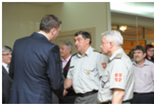
Figure 2a – The state support of scientific research work for the 60th anniversary of the Military Technical Courier ( http://www.vtg.mod.gov.rs/60godina-fotogalerija-2.html )

These questions are answered through an analysis of the event of a heuristically conceived problem (Fig. 4) in the territory of responsibility and beyond, ie. the territory of the Republic of Serbia. The problem is illustrated with the photos of various events in peace and emergencies, diagrams and the analysis and comparison of our results with the results of other researchers (Fig. 2: a, b, c, d).