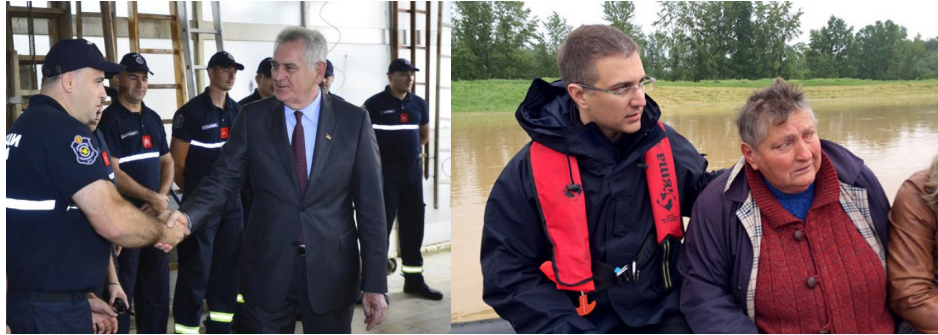
Figure 2c – Government support in emergency situations (floods in Obrenovac) Рус. 2в – Государственная поддержка в чрезвычайных ситуациях (наводнение в г. Обреновац) Slika 2c – Podrška države u vanrednim situacijama (poplava u Obrenovcu)