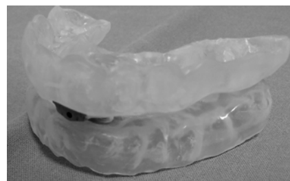
Fig. 1 – Thornton adjustable positioner (TAP) oral appliance for mandibular advance

registrator (Figure 2) occlusal impressions were taken in protrusive position at 50% of maximum mandibular advancement.