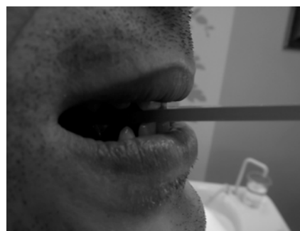
Fig. 3 – Chewing spatula

This position was described comfortable by the patients. Before receiving appliances patients were given rubber spatulas to chew on for a period of one week to accommodate temporomandibular joints to protrusive position of the lower jaw (Figure 3). After receiving oral appliances patients were given instructions not to sleep on their backs and avoid alcohol consumption during the study, as these are the factors that can contribute to symptoms progression 15 .