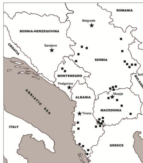
Figure 1. Collecting localities in 2014, 2016 and 2017 are indicated approximately by the solid black squares. Some squares represent more than one locality. The positions of the squares are not precise; refer to Tables 1, 2 and 3 for precise coordinates.

The geographical spread of these sites is indicated in Fig. 1.